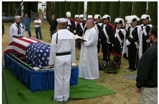
Pictured above: Assembly 0689 4 th Honor Guard / Pallbearers Internment at the ICC Cemetery